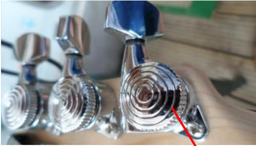
Turn tuner locking screw clockwise to lock anticlockwise to unlock string