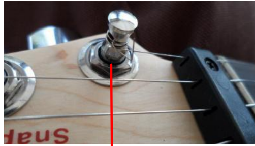
Make sure there is not more than one turn of string on the capstan too many turns may allow the string to unwind from the capstan when the instrument is folded