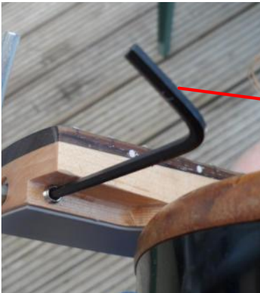
This key adjusts the neck position relative to the strings