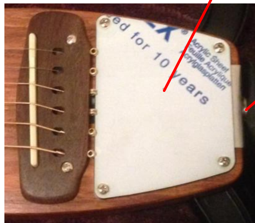
Rear strap hanger and jack socket