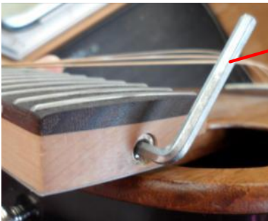
This key adjusts the truss rod for more neck relief turn clockwise for less neck relief turn anticlockwise